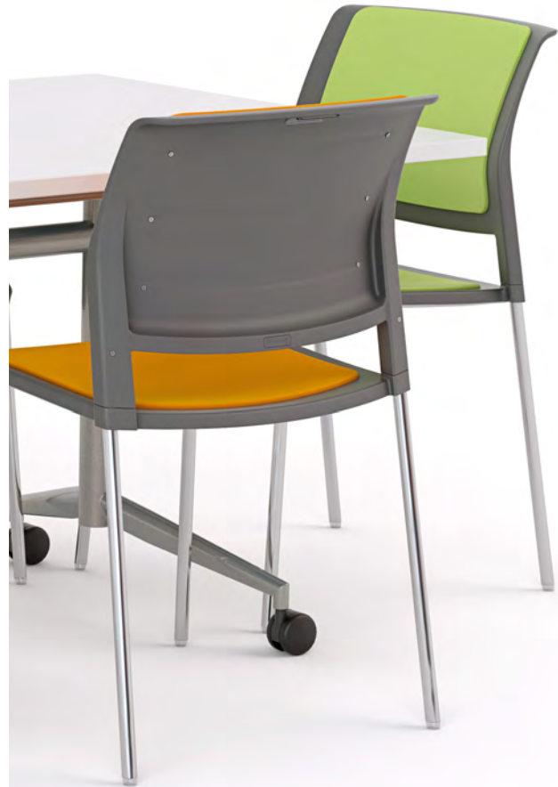
Showing Uni Flip Silver 72"x 30" with mixed colour Game Seating.

Connecting tables with tight joins is made easy with the very secure and simple-to-operate metal links.