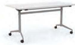
Uni Flip Silver Powdercoat